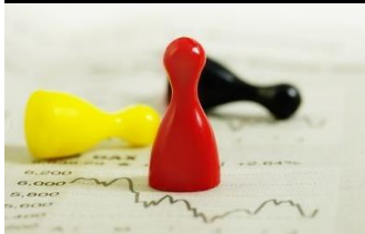
Enterprise Risk Management

FulcrumWay Leading Provider of Enterprise Risk Assessment Mitigation and Remediation Solutions