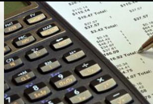
Financial Close Monitor