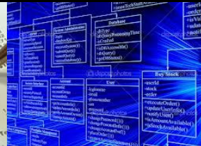
Advanced Controls Catalog